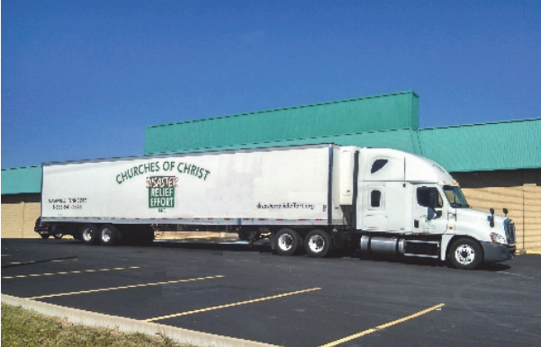
Trucks rolling across the nation to aid disaster survivors

1 Peter 5:8: "Be sober, be vigilant, because your adversary the devil walks about like a roaring lion, seeking whom he may devour." - NKJV